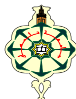
University of Tlemcen

Depuis 1993, le but principal du Groupe de travail « Protection Intégrée des forêts de chênes » est de promouvoir la recherche multidisciplinaire entre les scientifiques Européens et Nord africains afin d'établir des stratégies collectives de protection et de conservation des forêts de chênes. Apparemment focalisé sur les forêts de chêne-liège, le Groupe s'intéresse aux autres espèces de chênes car elles subissent également l'agression de parasites et de facteurs de déclin identiques.