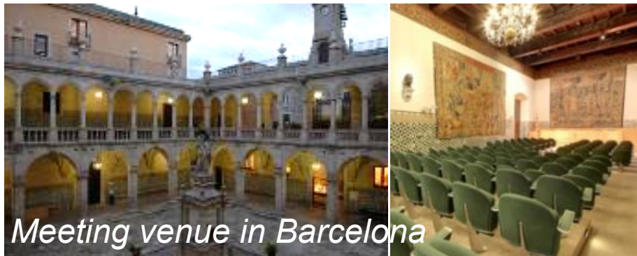
Meeting venue in Barcelona